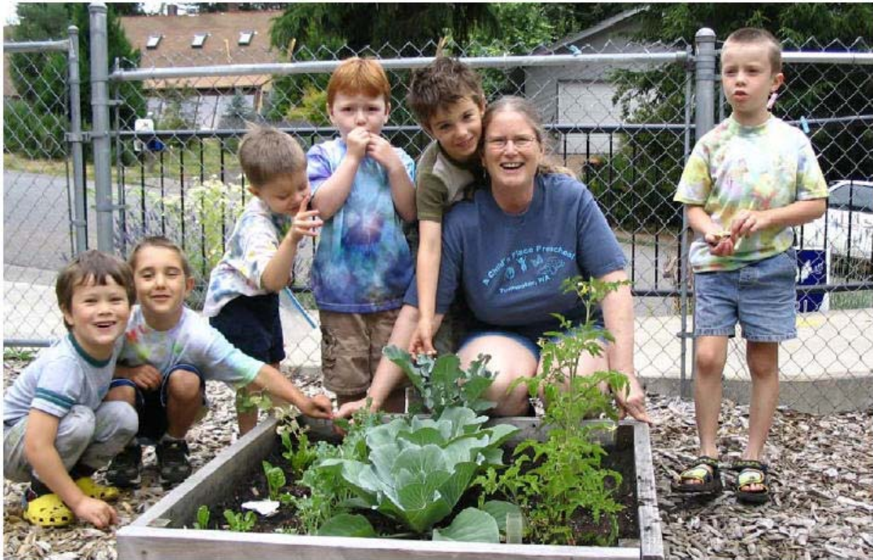
Picture from LWV 's Early Care and Education of Young Children Report